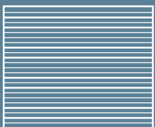
MODEL 1000 Deep Ribbed