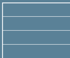
MODEL 3000 Flush Panel