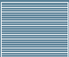
MODEL 1000 Deep Ribbed