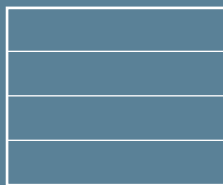
MODEL 3000 Flush Panel